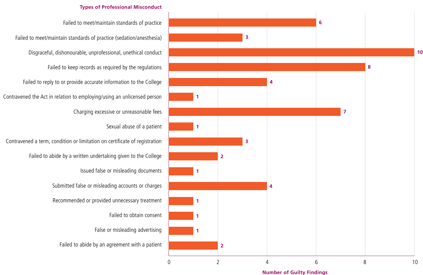
TABLE 1 PROFILE OF DISCIPLINE FINDINGS – 2016

Table 1 contains a profile of the number of findings with respect to the above-noted categories of professional misconduct.